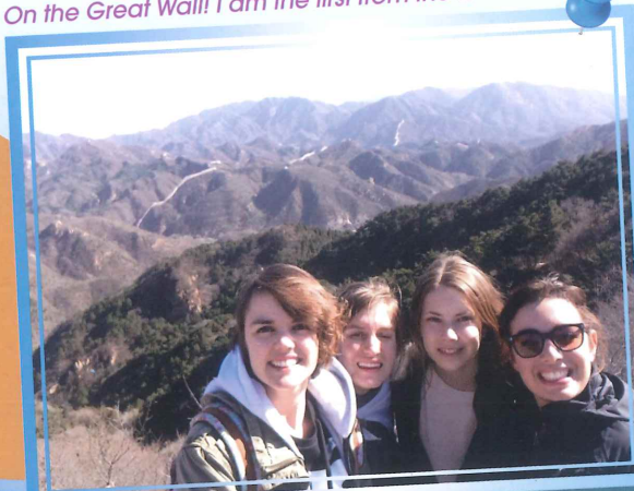
On the Great Wall! I am the first from the left.

Thank you to everybody who made this school year a year I will never forget.