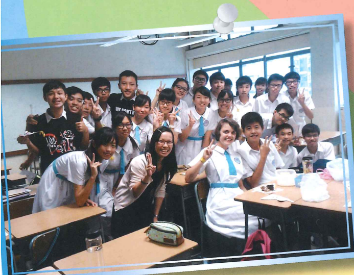
Thank you for my class for such a memorable birthday.