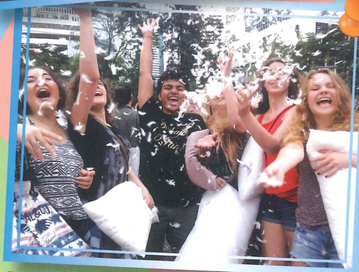
Feathers were flying during the pillow fight. I am no. 2 from the left.