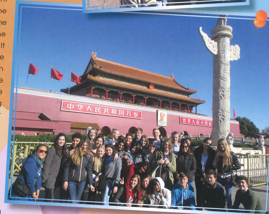
Here the whole lot is posing in front of Tiananmen Square. I am on the second row, no. 5 from the right.